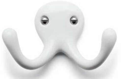
DOUBLE HOOK CAST-IRON ENAMELLED Width 10,5 cm. Weight 135 g. Order no. 113010