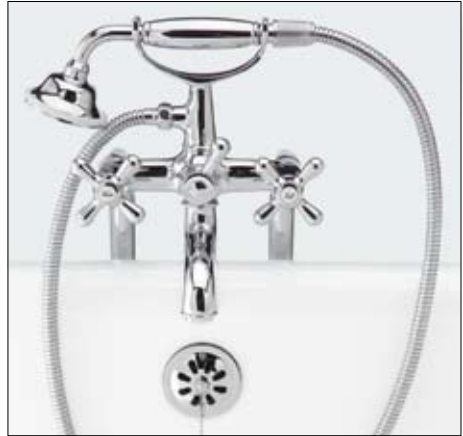
Fittings for freestanding bath, hand shower, shower hose

Floor-mounted: forked unit fitting free-standing bath tubs. It is connected to the water supply underneath the floor with two solid standpipes and a solid connector. The connector has a 1/2" thread for floor-mounted installation, at the top end the water carrying flexible stainless steel hoses are screwed on. All you need to do then is to fit the standpipes fixing them with set screws guaranteeing easy assembly and exact positioning of the standpipes. The unit has an outer 1/2" thread for connecting shower hoses. It comes with Neoperl jet control and integrated backflow prevention. Unit height 23,5 cm, width 22 cm, projection 15,5 cm. Weight 1,8 kg. Length standpipes 80 cm, 26 mm \emptyset . Weight of each standpipe 1,5 kg. Height up to lower edge of faucet 68 cm. Overall height 93 cm. Total projection 19 cm. Total weight 4,8 kg. Delivery excludes hand shower and shower hose.