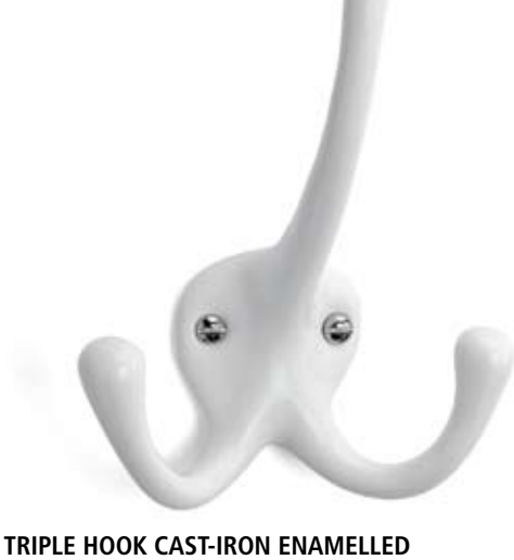
Projection 16 cm. Weight 300 g.