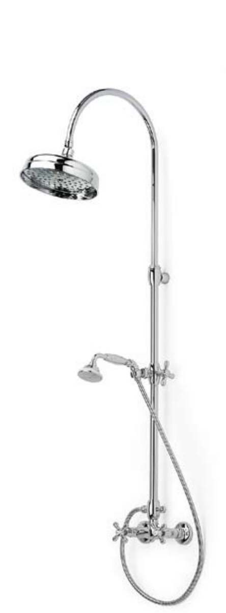
Exposed rods with shower faucet 179113, hand shower, hand shower joint and shower hose.

Shower faucet, shower head with globe joint (20 cm Ø), shower holder, exposed rods. Upper rod 2 cm Ø, below rod 2,4 cm Ø. Height to top edge max. 129 cm (adjustable 40 cm). Width 22 cm, projection 48 cm. Weight 3,8 kg. Delivery exclude hand shower, hand shower joint and shower hose. Order no. 179113