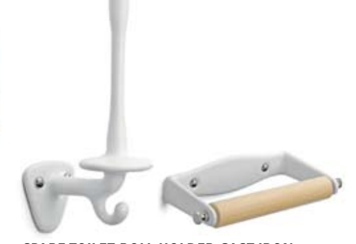
SPARE TOILET ROLL HOLDER CAST-IRON ENAMELLED

Height 16,5 cm. Weight 300 g. Order no. 113019