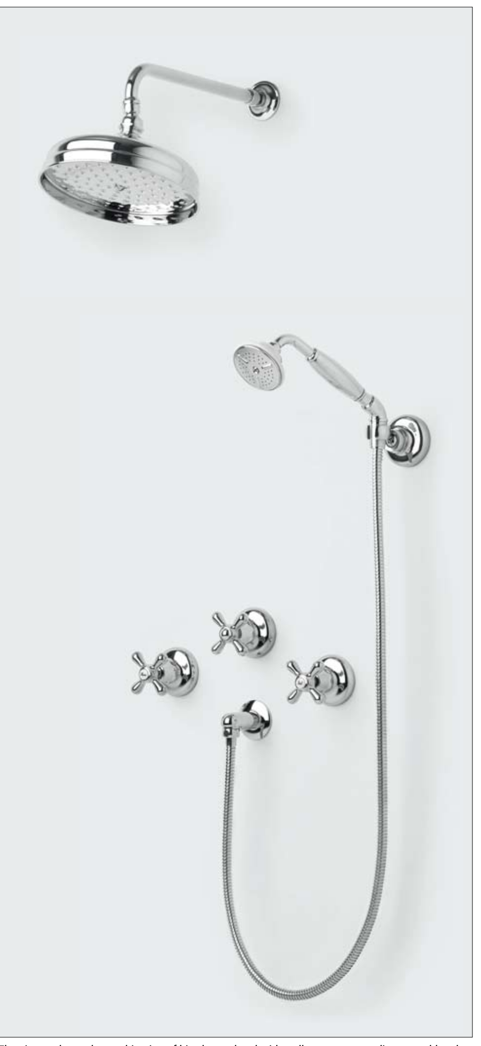
The picture shows the combination of big shower head with wall arm, two-way diverter, cold and hot water valve, wall elbow, shower hose, hand shower, hand shower joint and wall bracket.

Wall elbow made of brass with 1/2" connection for attaching to the water supply and 1/2" connection for attaching a shower hose. The wall elbow merely needs to be connected to the water supply using a screw-on connector. This ensures simple and precise positioning. 2,6 cm Ø, projection 6 cm, wall rosette 5,5 cm Ø. Weight 300 g. Delivery excludes shower hose, hand shower, hand shower joint and wall bracket.