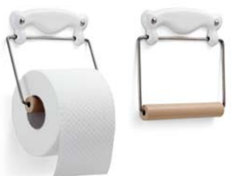
TOILET ROLL HOLDER CAST-IRON ENAMELLED With wooden roll. Height 15 cm. Widht 14,5 cm. Weight 190 g. Order no. 100012

With wooden roll and cover. Width 17,5 cm. Weight 1,7 kg. Order no. 113016