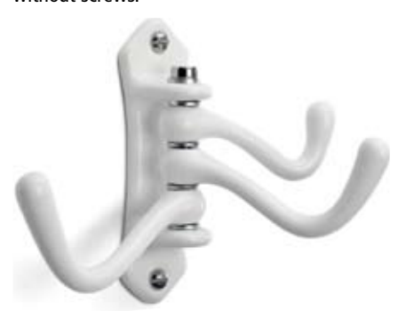
TRIPLE SWIVEL HOOK CAST-IRON ENAM-ELLED

Note: The following items are supplied without screws.