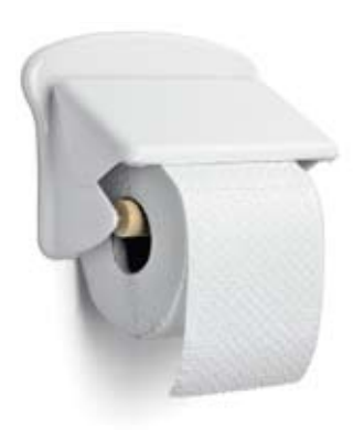
HEAVY TOILET ROLL HOLDER CAST-IRON ENAMELLED

With wooden roll and cover. Width 17,5 cm. Weight 1,7 kg. Order no. 113016